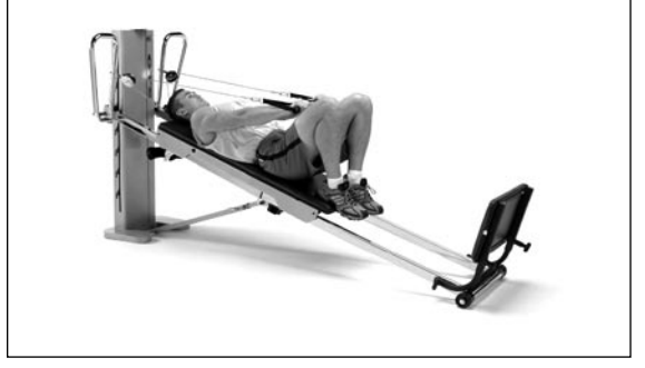
Lying Supine continues >